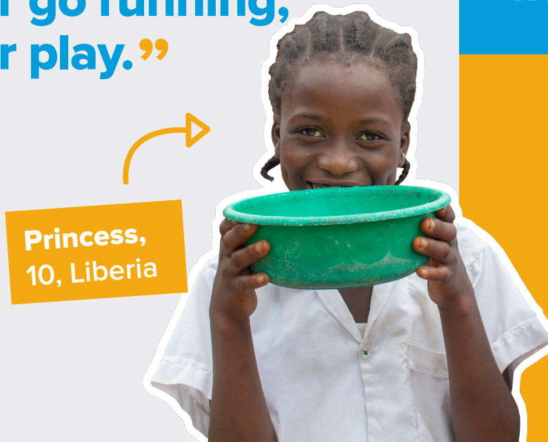
Princess, 10, Liberia

“When you eat, you can study, or go running, or play.”