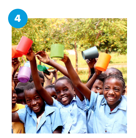
5 Children for a Year | $158.50

Whether it's a contribution for mugs or feeding an entire class you will be supporting work that has a long-lasting impact in communities that need it most.