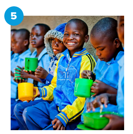
10 Children for a Year | $317