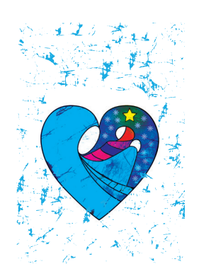
5 Pack Holiday Cards | $10/each

You will receive a pack of the design shown