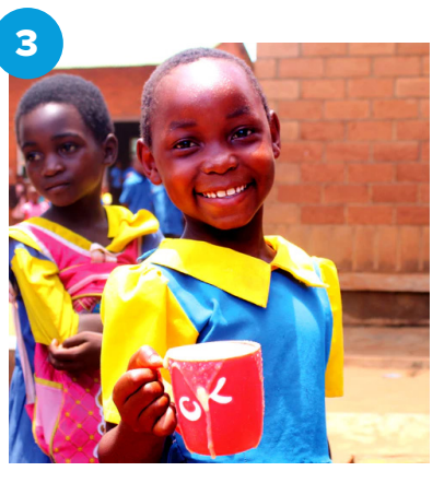
One Child for a Year | $31.70