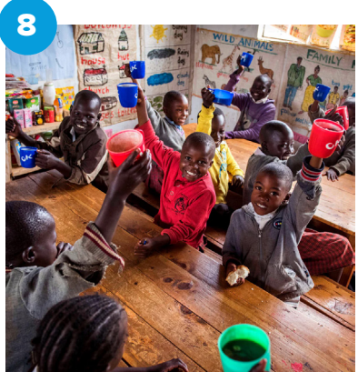
Adopt a Class (27 students) | $856