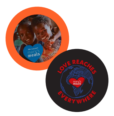
3 Pack Stickers | $10/each

You will receive a mixed bundle of the designs shown