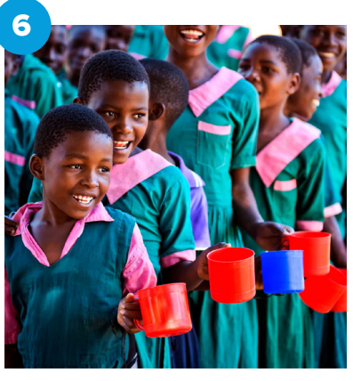
250 Mugs/Plates | $90