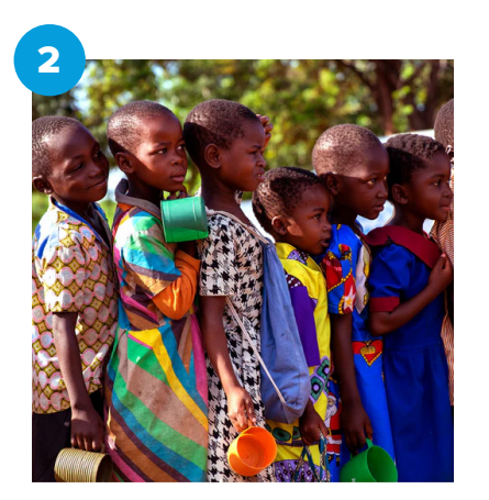
100 Meals | $16.00