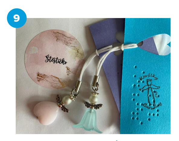
Barunka's Angels | $20/each