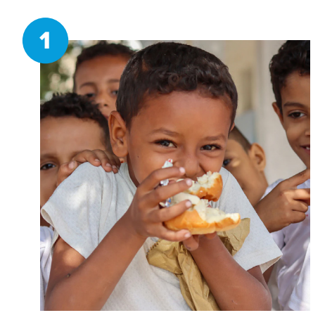
50 Meals | $8.00

Your generosity can change lives in the countries we serve. Our life-changing gifts are a representation of this generosity.