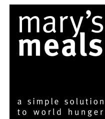
Black and white alternative