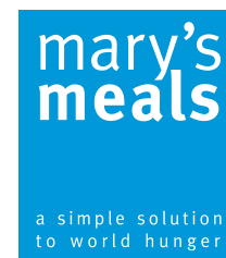
White text alternative