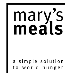
White and black alternative